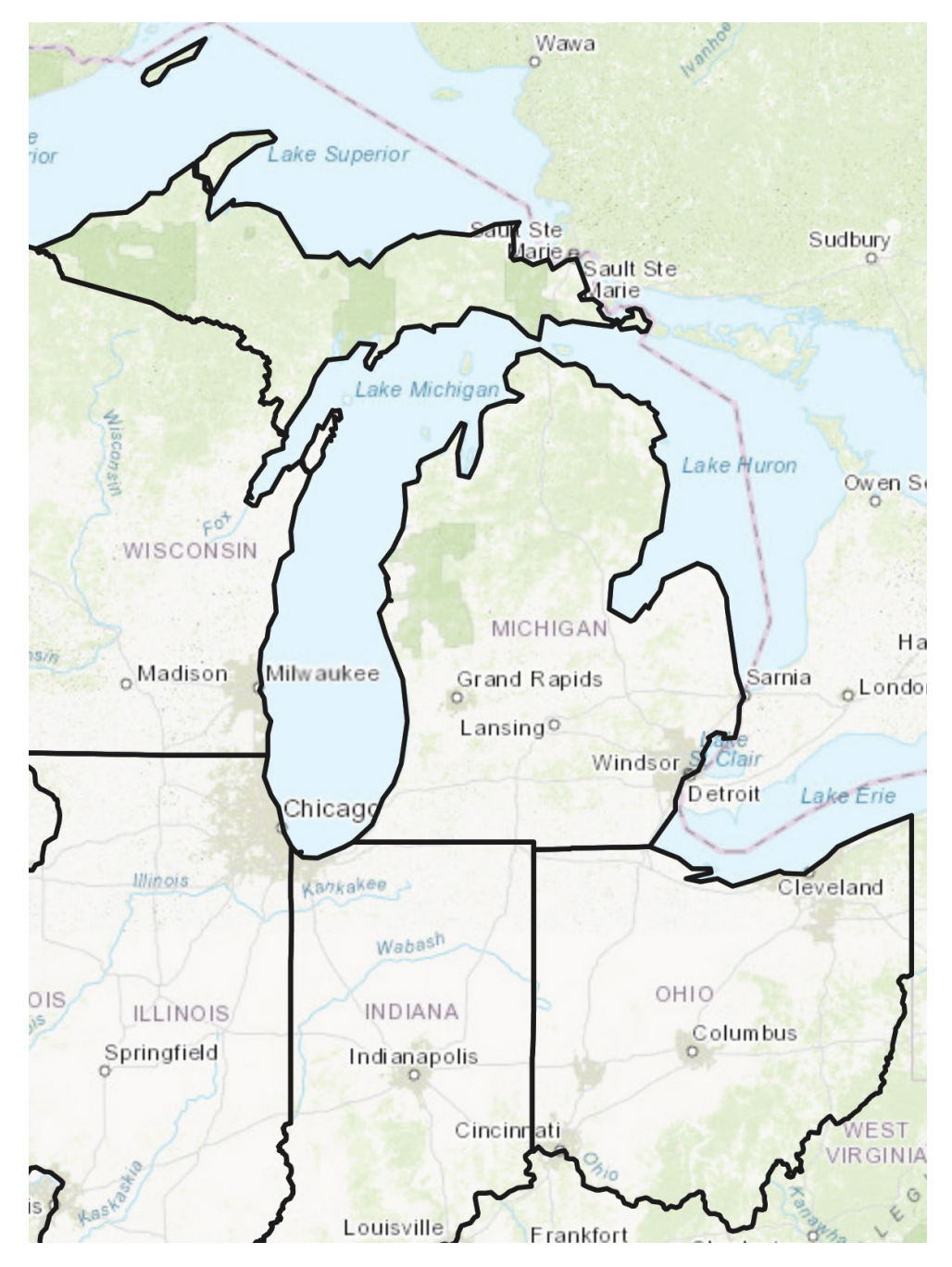
Figure 1. The geology and climate of the Great Lakes influence soil types, precipitation and temperature variations, microclimates and changing climatic conditions that Michigan and Ohio specialty crop growers factor into their management decisions.

Agriculture is an important component of the state's economy with annual sales of over $8.68 billion; of which specialty crops are $1.45 billion. The state is surrounded by four of the Great Lakes: Lake Michigan, Lake Superior, Lake Huron, and Lake Erie which influence the precipitation, wind patterns, humidity and moderate temperatures. The climate of the region including an abundance of water is well suited to growing a large variety of fruits and vegetables. However, in recent years the state, like much of the upper Midwest has experienced an increase in annual precipitation and storm intensities, which affect soil moisture and specialty crop management and production decisions.