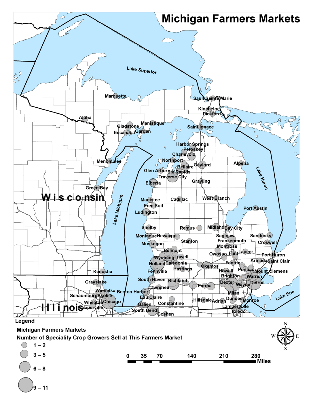
Farmers market distribution in Michigan and the number of specialty crop growers who Figure 3. sell at those markets.