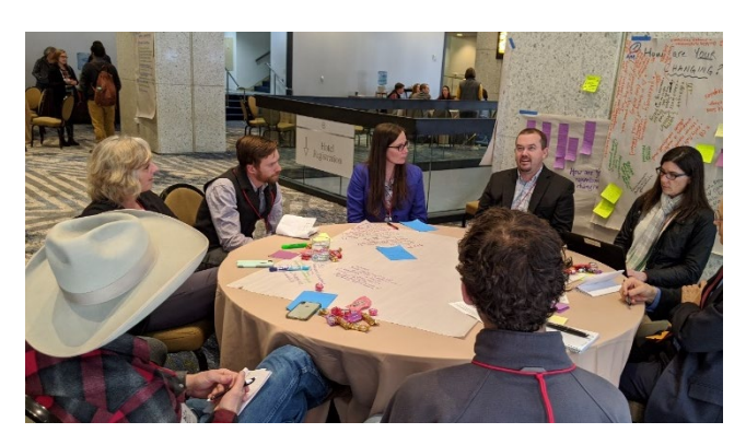
2020 SRM World-Café-style "Campfire Conversation" about climate-related changes and management challenges in rangeland ecosystems.

The Northern Plains Climate Hub co-organized a World-Café session at the 2020 Society for Range Management (SRM) meeting in Denver. Roughly 150 meeting participants engaged in three rounds of facilitated small-group discussion about a variety of topics, including adapting rangeland management to climate change, land ownership shifts, and public-lands restoration. As part of the event, the Northern Plains Climate Hub partnered with Bureau of Land Management and North Central Climate Adaptation Science Center to facilitate discussions with range managers and researchers about changes they have observed in their rangelands, management challenges exacerbated by climate change, and potential adaptation options.