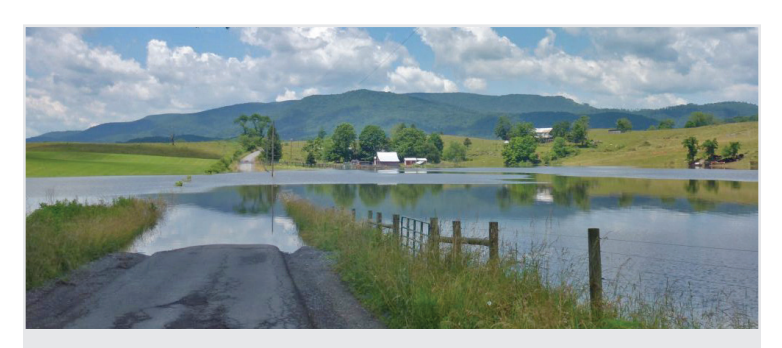
"Family farms took a hard blow from rising water as hayfields were quckly transformed into lakes."

While most of the Northeast is experiencing abnormally dry weather, West Virginia has been hit with record rainfall causing massive damage and loss of life. June precipitation ranged from less than 25% of normal in much of New England and the Mid-Atlantic to more than 200% of normal in southern West Virginia. Parts of West Virginia received more than 8 inches of rainfall on June 24th making it the wettest day on record, more than doubling the previous record, and also making June the wettest month on record. Reports starting to come in from West Virginia suggest that farmers lost about $1.6 million in corn, $1.4 million in hay and $100,000 worth of pasture. Damage to farms structures such as barns and fencing totaled another $1 million. Crops that were under water but not otherwise damaged will have to be destroyed due to the presence of mold and toxins that will make them unfit for consumption.