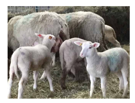
Ewes and young lambs, Signal Rock Farm, Charlton, MA

producers in RI and our unique crop profiles.