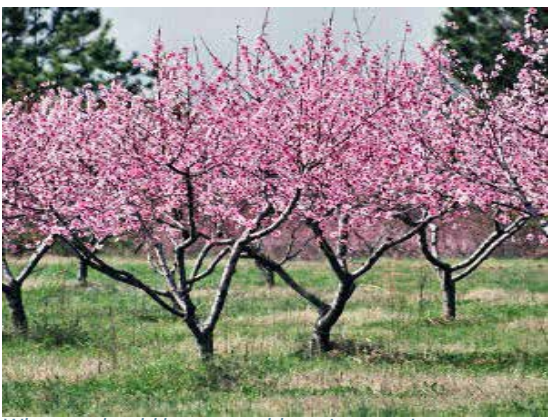
What we should have seen: blooming trees!

The lack of a normal peach crop extends from New Jersey to Maine, So this year you may have to travel south as far as Georgia to get fresh peach-