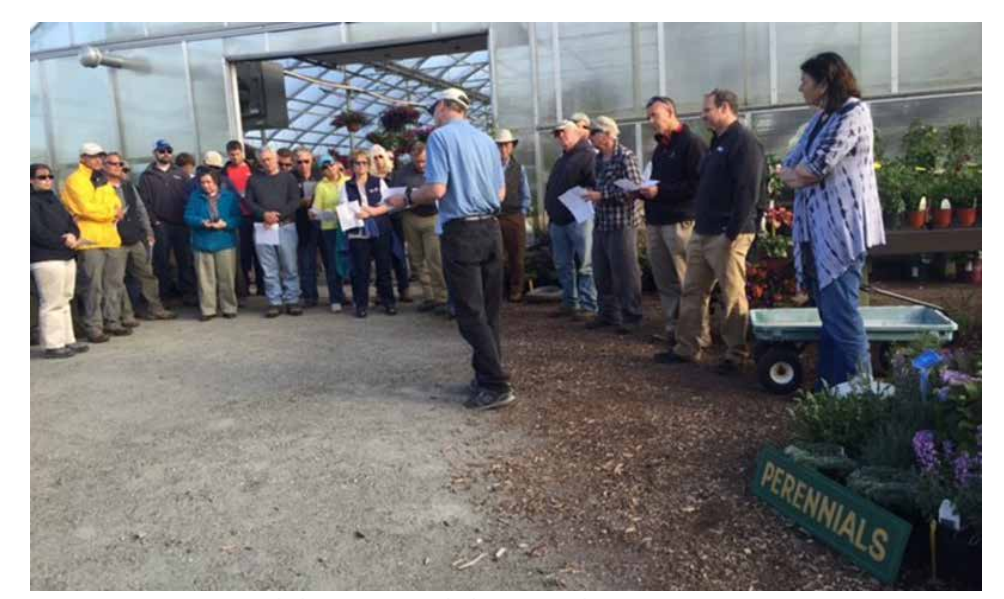
Participants at RINLA Twilight Meeting at Clark Farms and Morning Star Nursery.