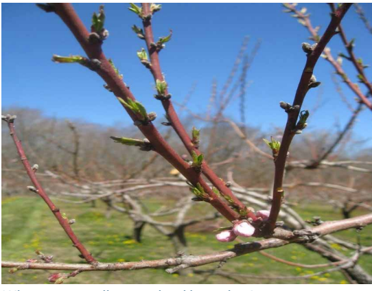
What we actually saw: dead branches!