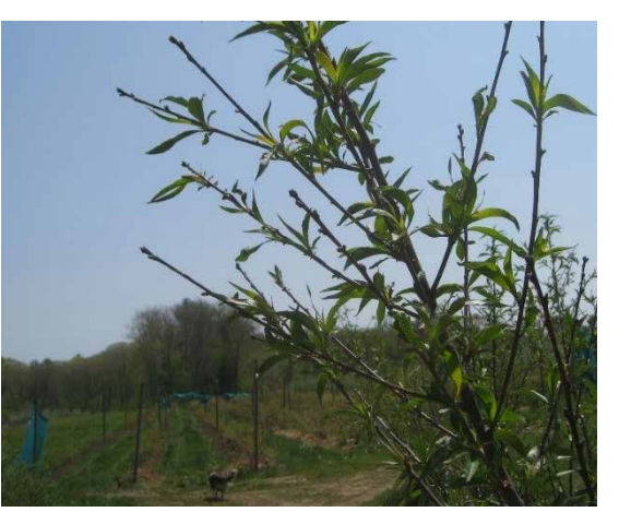
What we actually saw: no blooms!

es, or find the few growers in RI that report some surviving peaches. You will be lucky if you find them.