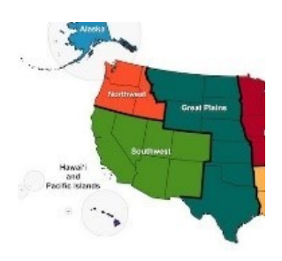
5th National Climate Assessment Public Comment The period for public comment on the 5th National Climate Assessment is now open until 27 January 2023. Note that all feedback received through these reviews will be considered by the chapter authors for future drafts of the assessment.

The goal of this survey is to gather information about impacts and response actions implemented during the 2022 water year (October 1, 2021 -September 30, 2022) due to abnormally dry or abnormally wet conditions.