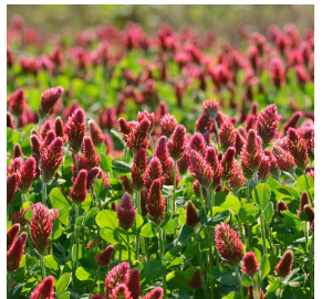
Northwest Cover Crops This Hub webpage describes how cover crops can make farms more resilient to the impacts of climate change by enhancing soil health and water quality.